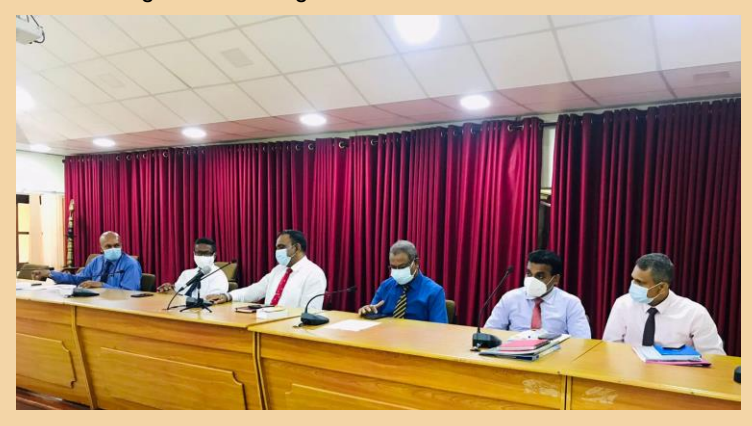
Branch reorganization Programme - Rathnapura

Branch reorganization Programme - Matara